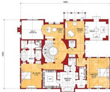
SECOND LEVEL 285 m 2