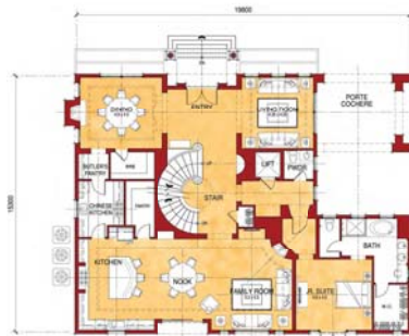
FIRST LEVEL 258 m 2