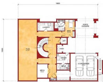
SUBTERRANEAN LEVEL 50 m 2