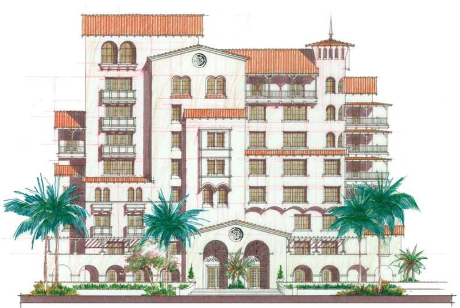
Conceptual Front Elevation Study